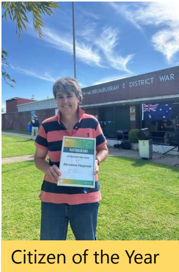
Citizen of the Year