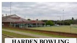
HARDEN BOWLING CLUB