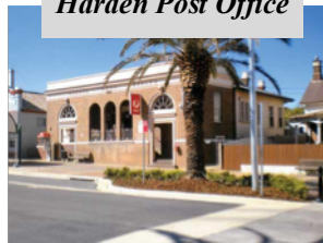
Harden Post Office