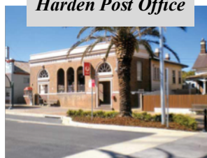
Harden Post Office