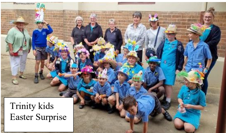
Trinity kids Easter Surprise