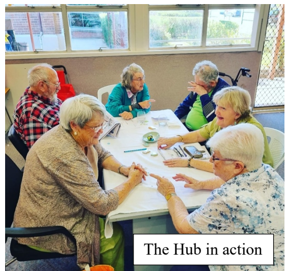
The Hub in action