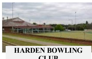
HARDEN BOWLING CLUB