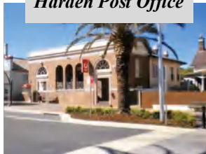
Harden Post Office

Trinity Centre 27 East Street (PO Box 199) HARDEN NSW 2587 Phone: 02 6386 3561 Fax: 02 6386 3785 Email: manager@flexicare.org.au Website: www.flexicare.org.au