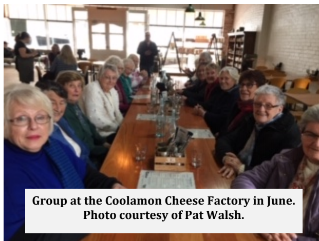
Group at the Coolamon Cheese Factory in June.