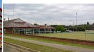
HARDEN BOWLING CLUB