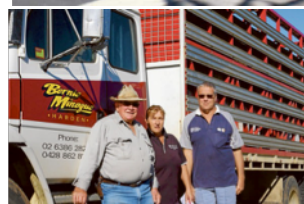
PEISLEY LIVESTOCK TRANSPORT